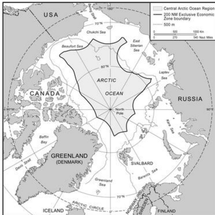
Figure 1: Map of central Arctic showing Exclusive Economic Zones (EEZs) and HE. region of the High Seas (shaded grey)